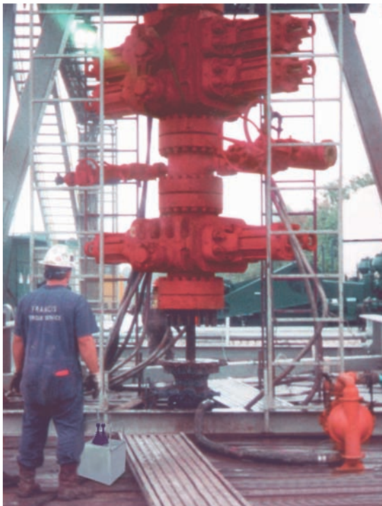
Faster and Safer B.O.P. Lifts

Extreme Lift Capacities - In excess of 100,000 pounds straight pull with quick setup and increased safety.