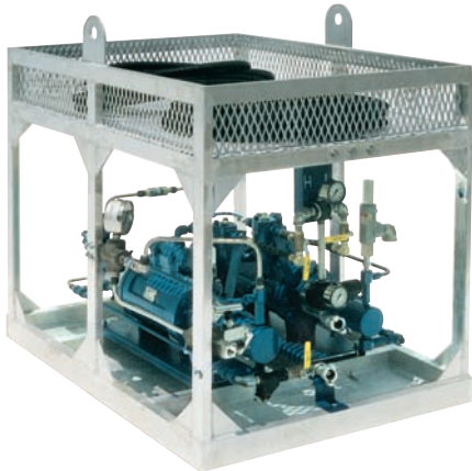
Air Powered Two-Stage "Piggy Back"

Francis Torque Service offers hydrostatic pressure testing services to the drilling and production industry, as well as to plants, refineries, pipelines and construction facilities in the Gulf South. We provide trained, experienced personnel, diesel pumps with capacities in excess of 20,000 psi or air powered, portable units with capacities in excess of 10,000 psi.