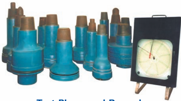
Test Plugs and Recorders

Plants/Refineries, Fabrication/Construction - Pipelines, Flowlines, Heaters, Exchangers, Separators, Reactors; Filling, Pigging, Gauging, etc.